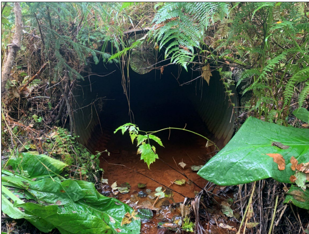
Figure 1.–Culvert outlet at waypoint 1768.