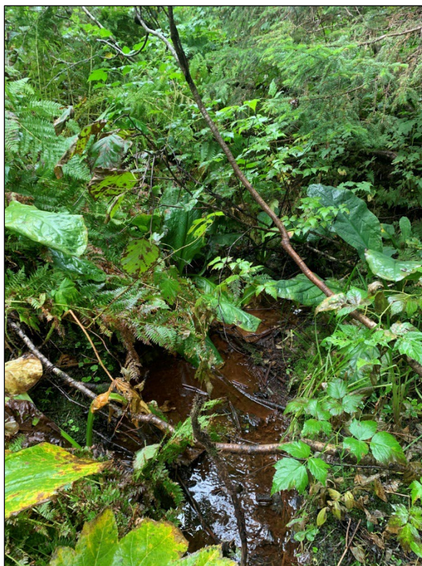
Figure 3.—Channel at waypoint 1768.