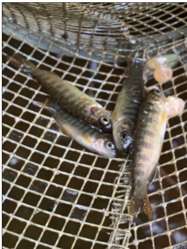
Figure 2.—Juvenile coho salmon captured at waypoint 1768.